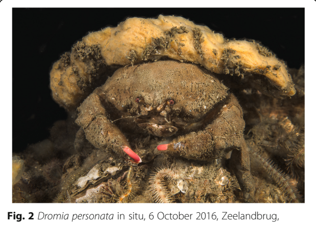
Eastern Scheldt.

In 2017, at least two individuals of Dromia personata were sighted in the Eastern Scheldt. On 9 April, a moribund sponge crab without cover was found at the Zeelandbrug and on 27 July and 2 August, a sponge crab was seen at Schelphoek (51° 41′ 02″ N, 003° 49′ 07″ E). This indicates that the local occurrence is not limited to a single-season event.