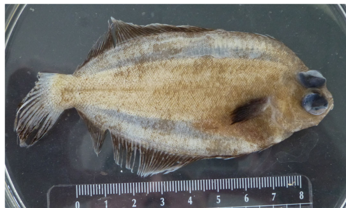
Fig. 2 Poecilopsetta colorata Günther, 1880, MNHN2016-0180 from the Sakalaves seamount, collected on Oct. 14, 2014. Standard length 100 mm

From the aligned COI sequences for the samples of the three Poecilopsetta species included in this study (see methods), 28 variable sites were observed along the 684-bp long sequenced fragments (Fig. 3). This represents 2.76 % interspecific nucleotide divergence on average (evaluated by uncorrected pairwise p-distance). The nucleotide divergence among five P. natalensis samples collected from South Africa ( n = 4 ) and from the South China Sea ( n = 1 ) was estimated to be 0.64 %. Diagnostic nucleotides of P. colorata to P. natalensis are site numbers 046, 126, 225, 252, 315, 360, 420, 444, 477, 510, 513, 565, 612, 618, 621, and 639. Diagnostic nucleotides of P. colorata to P. hawaiiensis are site numbers 210, 225, 313, 315, 369, 390, 477, 505, 510, 513, 537, 549, 561, 594, 603, 618, 621, and 678 (Fig. 3). The available genetic data further confirm that our specimen is distinguishable from the co-occurring species from the region, P. natalensis .