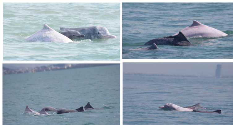
Fig. 2 Pictures of S. chinensis taken during the present boat surveys

with an average of 135 km 2 (Hung 2008). The present new sightings are located nearly more than 300 km away from previously known habitat of S. chinensis . This coast is a prime tourist destination and hosts dense human populations, especially during the winter tourist season. However, although these waters are generally subject to high economic pressure and coastal development, the Beibu